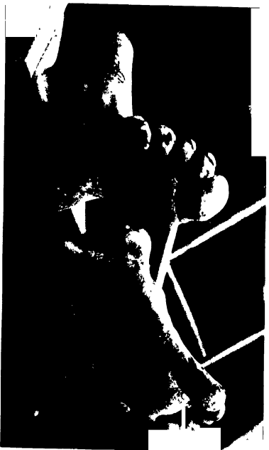
Kuda Bux's feet, quite unjured, after fire-walk rehearsal. September 9, 1935